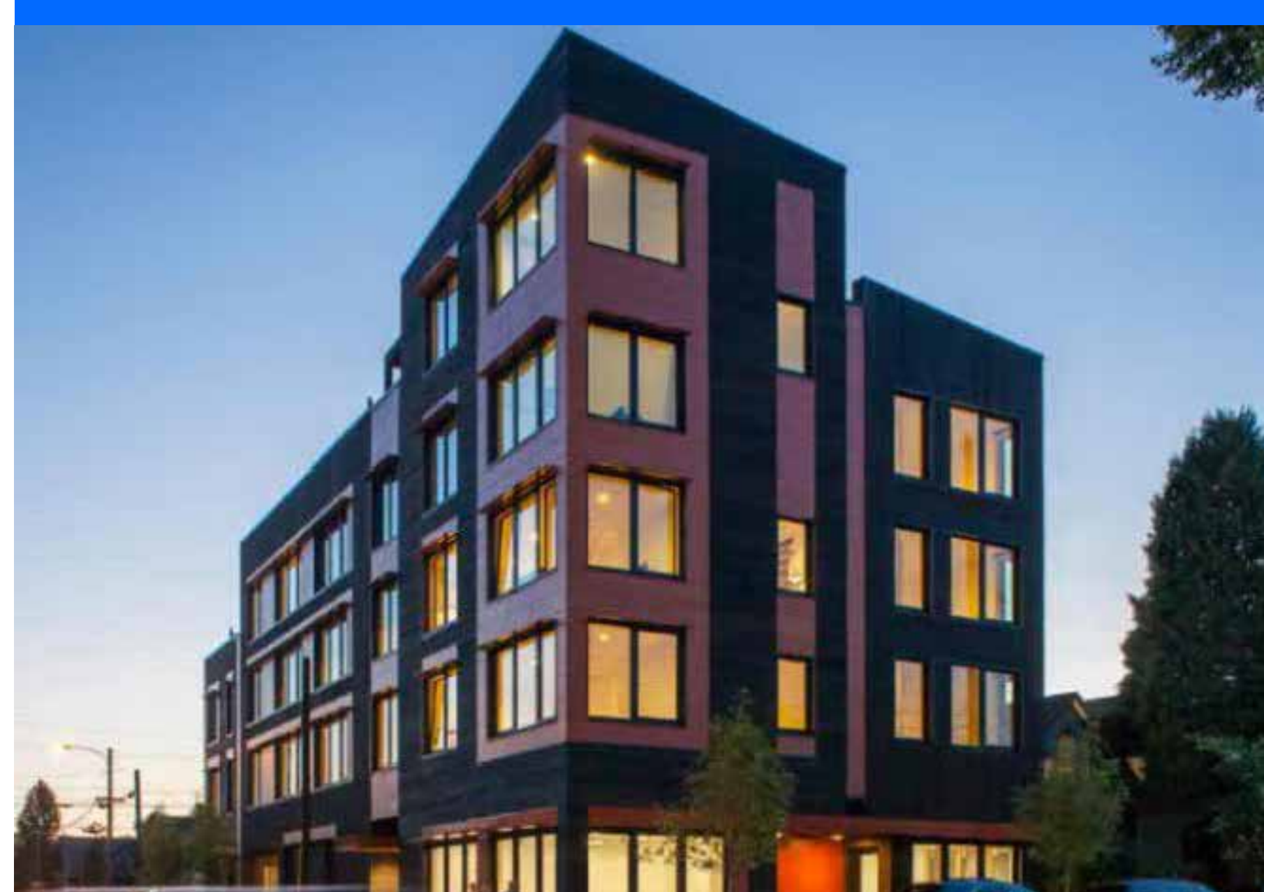
Quebec City, QC